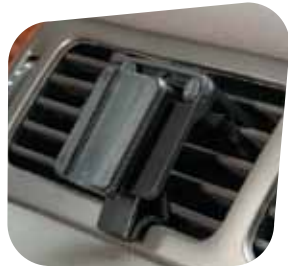
VENT OPTION INCLUDED