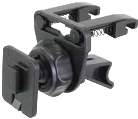
360° ROTATING AIR VENT MOUNT

SECURE YOUR PORTABLE DEVICE IN SECONDS. USE WITH MOST ELECTRONIC DEVICES.