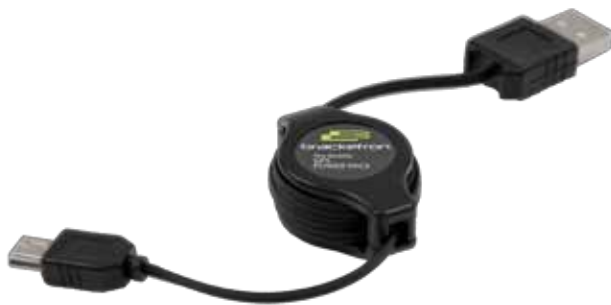
RETRACTABLE USB CORD

Use with Garmin®, TomTom®, or Magellan® GPS units.