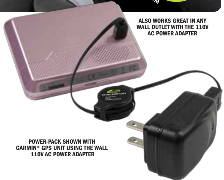
ALSO WORKS GREAT IN ANY WALL OUTLET WITH THE 110V AC POWER ADAPTER

Our exclusive Universal GPS Power-Pack includes everything you need to charge your Garmin®, TomTom® or Magellan® GPS unit in your car, office or home. The Power-Pack includes a retractable USB cable, a wall charger and a vehicle charger.