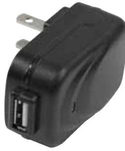
110V WALL ADAPTER