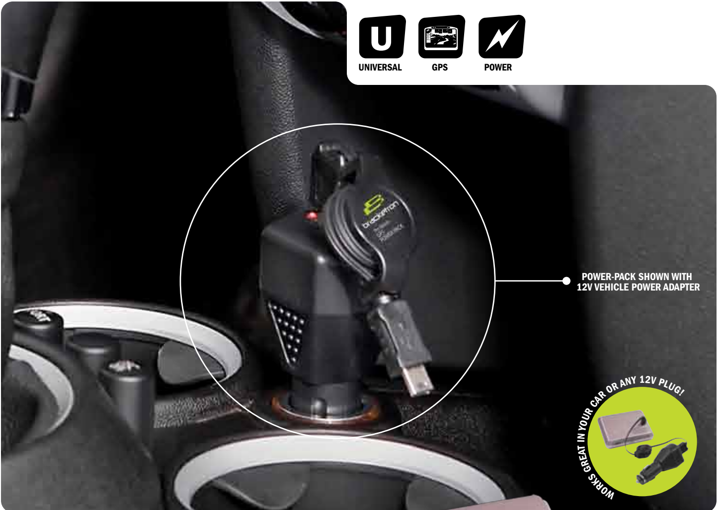
POWER-PACK SHOWN WITH 12V VEHICLE POWER ADAPTER