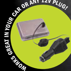
WORKS GREAT IN YOUR CAR OR ANY 12V PLUG!

The ideal solution to quickly and easily charge your mobile GPS unit in your vehicle or wall outlet.