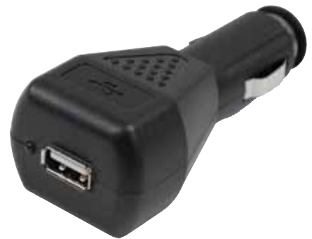
12V VEHICLE ADAPTER